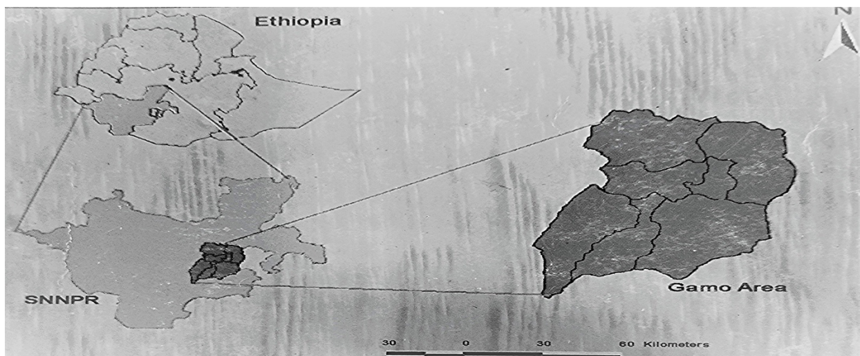
Gamo Zone (Wondimu 2010)

Like the Oromo and the Amhara, the Gamo are also patriarchal and patrilineal people. Furthermore, they have a strict caste system which hierarchically divides them into three groups. These are: the mala which consists of the highest prestige, farmers and weavers; the mana which consists of potters; and the degala which consists of the lowest prestige, ironsmiths, and hide-workers (ibid).