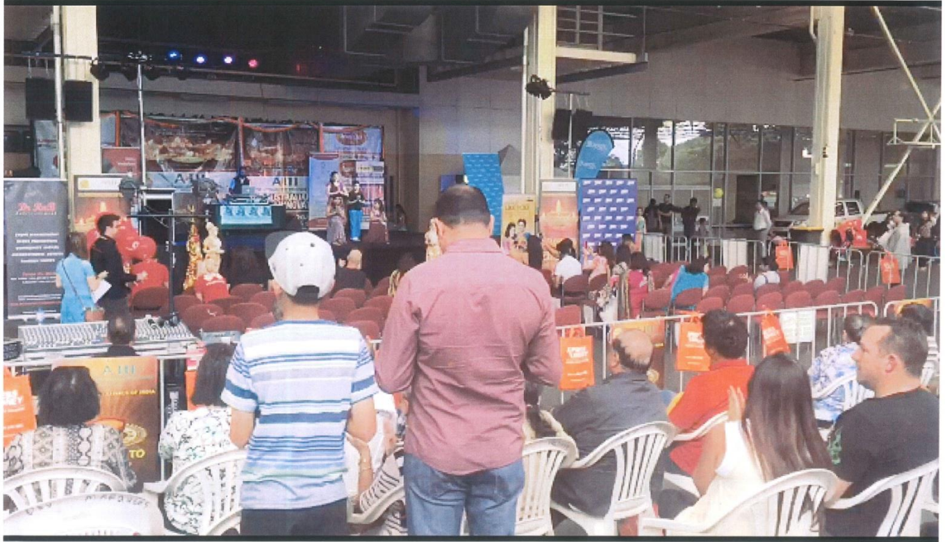
Indo-Australians celebrating Diwali in Australia