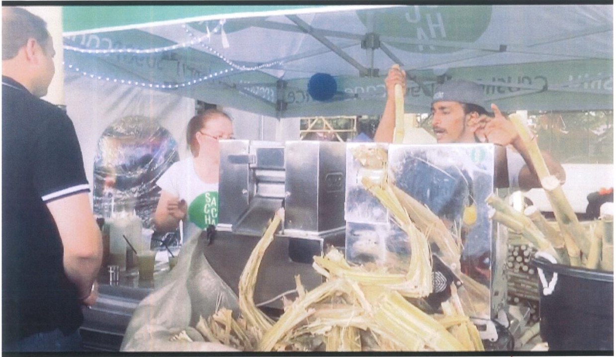
White lady and Indo. Australian making Sugarcane juice for visitors.