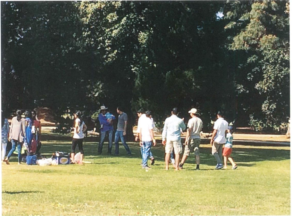
Indo. Australians relaxing to a park w/ Melbourne