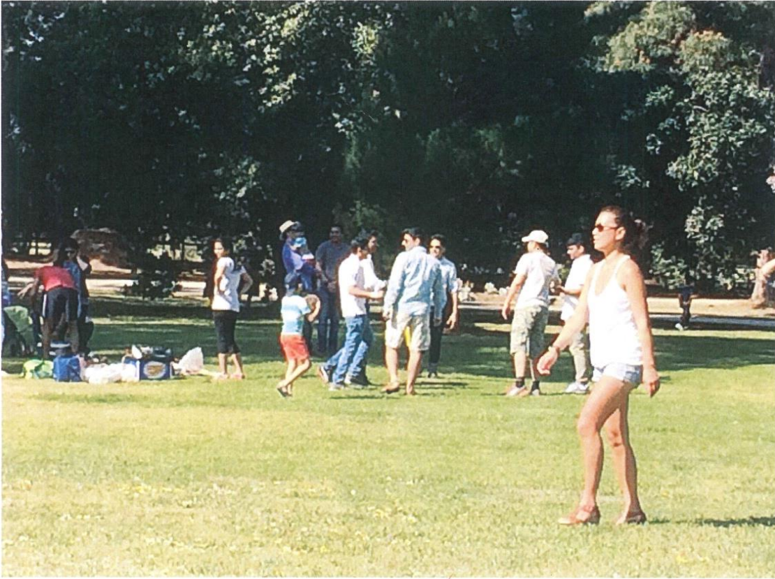
Indo. Australians having a picnic in a Melbourne Park.