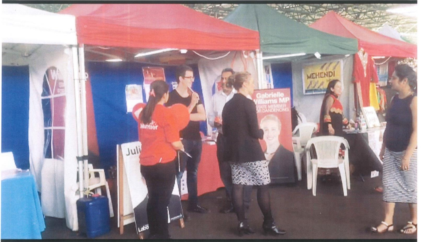
White Australians and Indo-Australians celebrating Diwali Festival