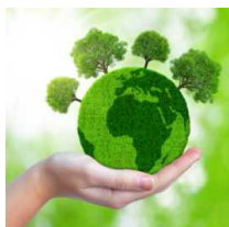
Life & Earth Sciences