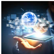
Business & Media