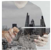
Engineering & Technology