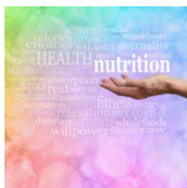
Natural & Health Science