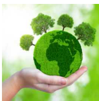
Life & Earth Sciences