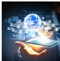
Business & Media