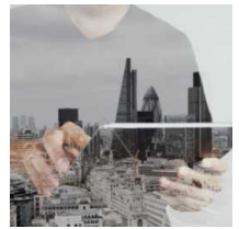
Engineering & Technology